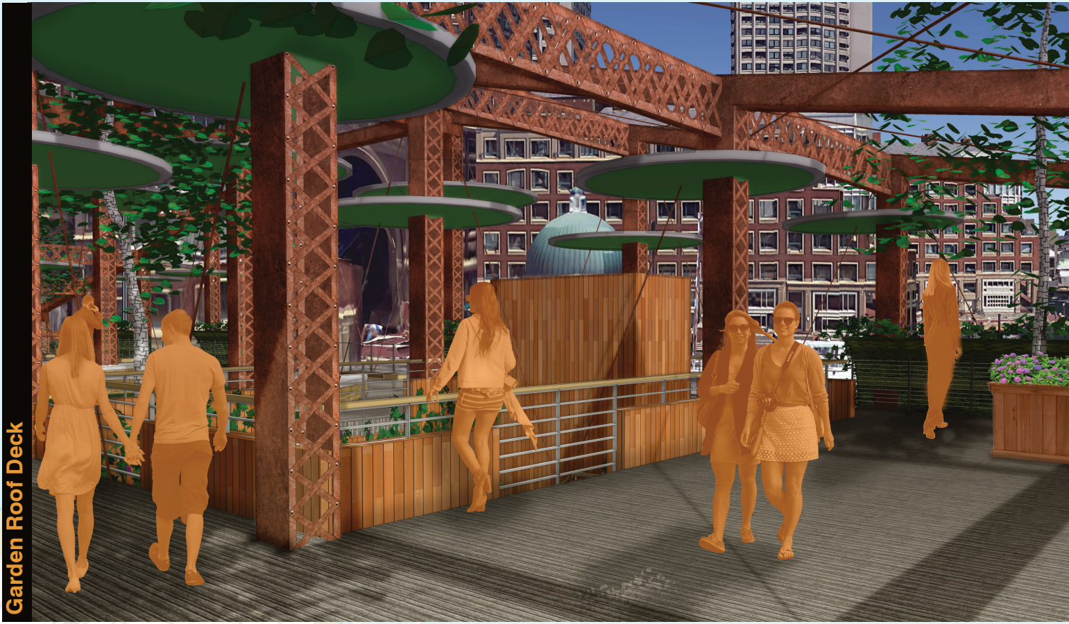
The crowning jewel is the Garden Roof Deck, an outdoor park above the center portion of the bridge. The self sustaining nature of the bridge is demonstrated by the circular solar panels integrated into the structure, generating the power needed for lighting and providing a natural canopy. This space will serve as an authentic display space for historic and cultural exhibits, a meeting point, a viewing platform for sweeping vistas of the harbor and skyline, and as a city retreat into nature.