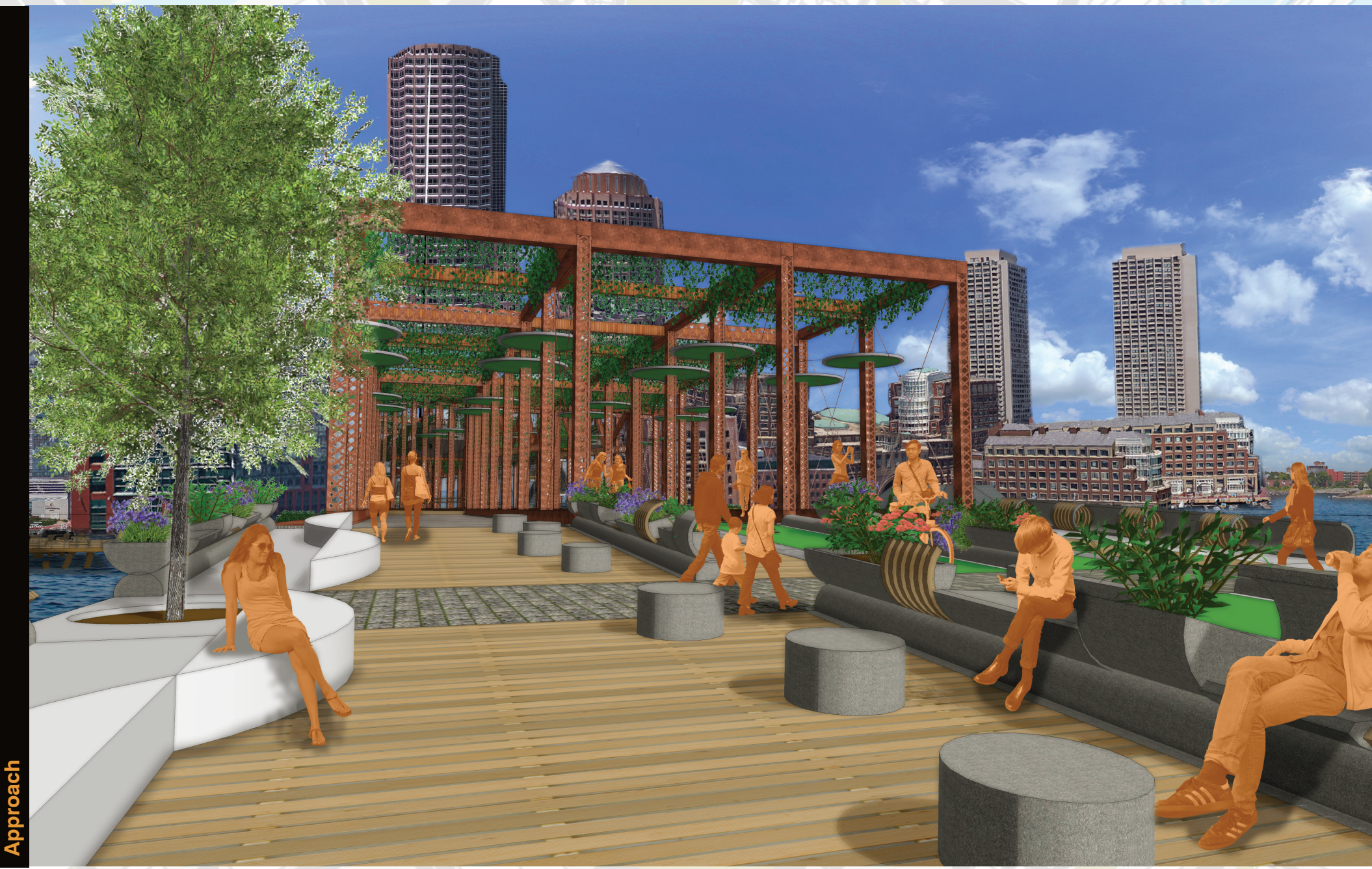
The approach at either end will be gently ramped and terraced, becoming a city park and vibrant streetscape. The entire bridge will be raised by eight feet, maintaining water access and allowing the Harborwalk to pass beneath the bridge.