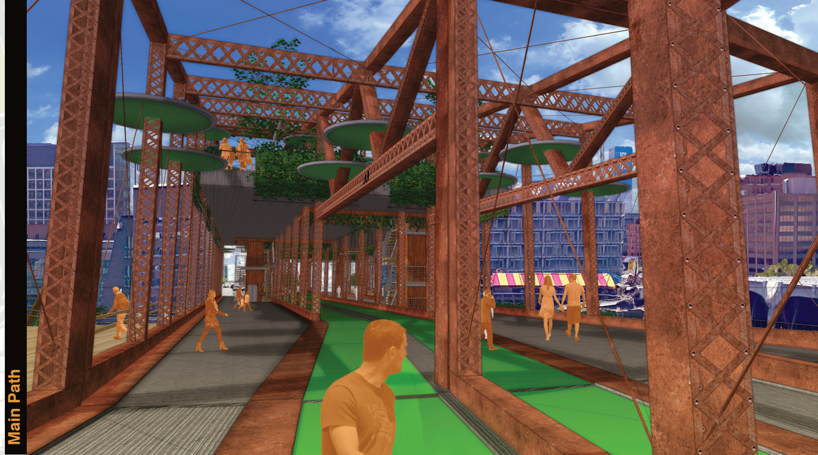
The roadway will be rated for traffic and light rail so that it may accept the occasional vehicle for festivals, and mass transit as the Seaport develops. The swing portion of the bridge will be pivoted and fixed closed referencing its' industrial engineering.