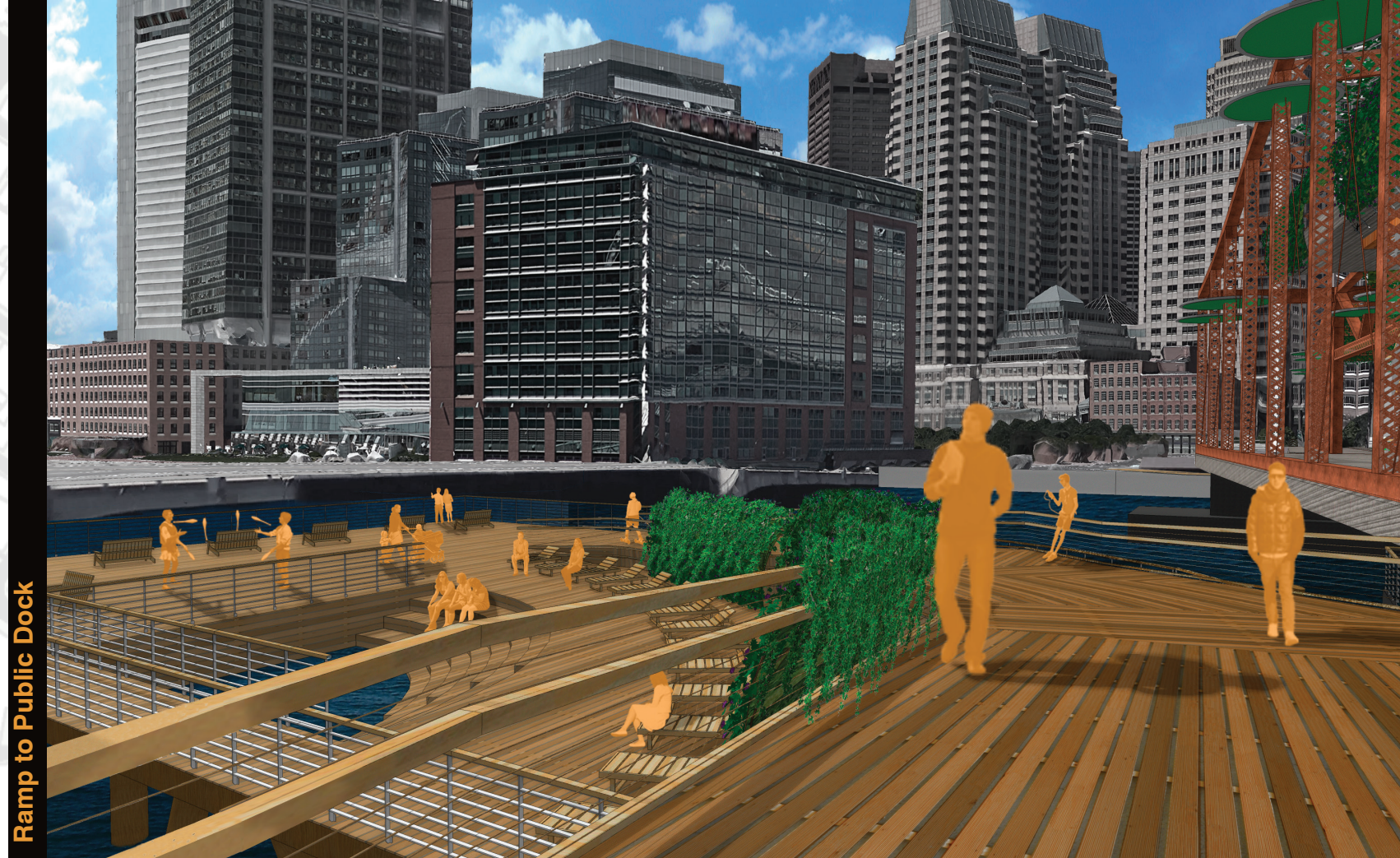
Curved ramps provide access to the public docks featuring a toe dip pool, and the historically restored Tender's House, reused as a local cafe.