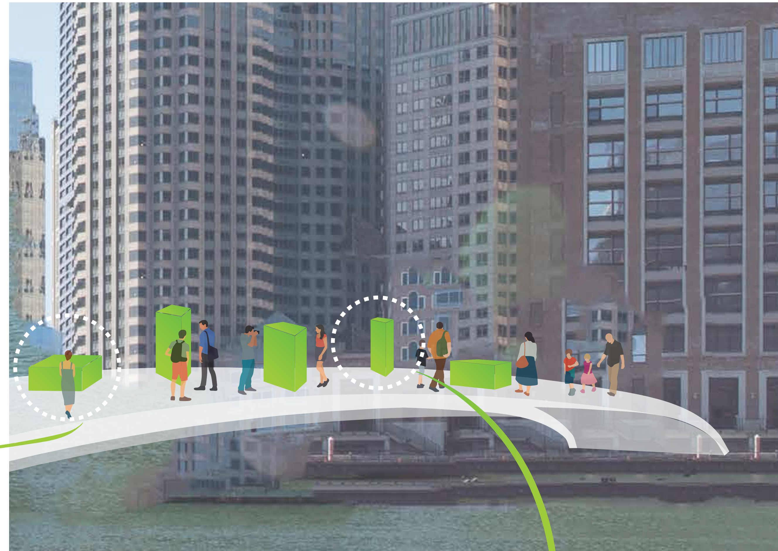
DESIGN OF BRIDGE TO BE PROPOSED BY OTHERS

The inaugural exhibit would be about bridge design and the Northern Avenue Bridge would be one of the featured sculptures.