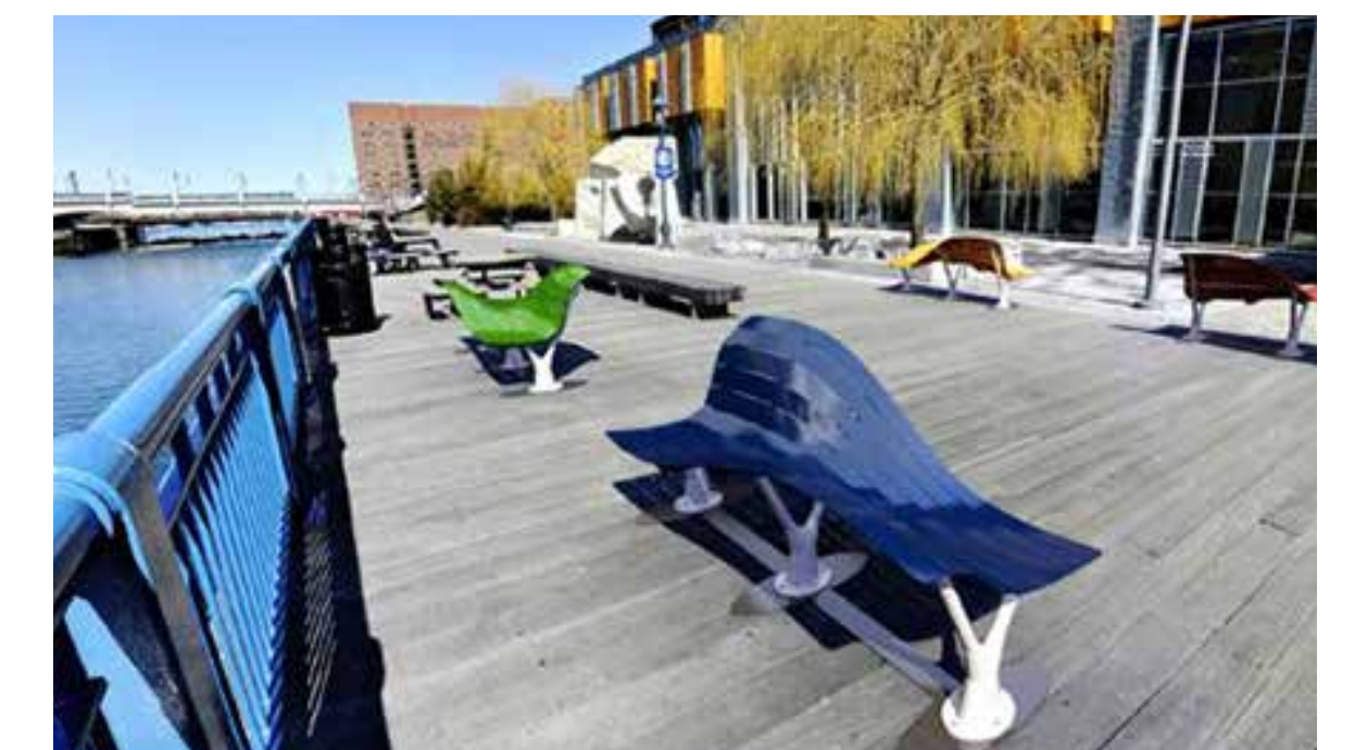
Street Seat Design Challenge Installation BOSTON, MASSACHUSETTS