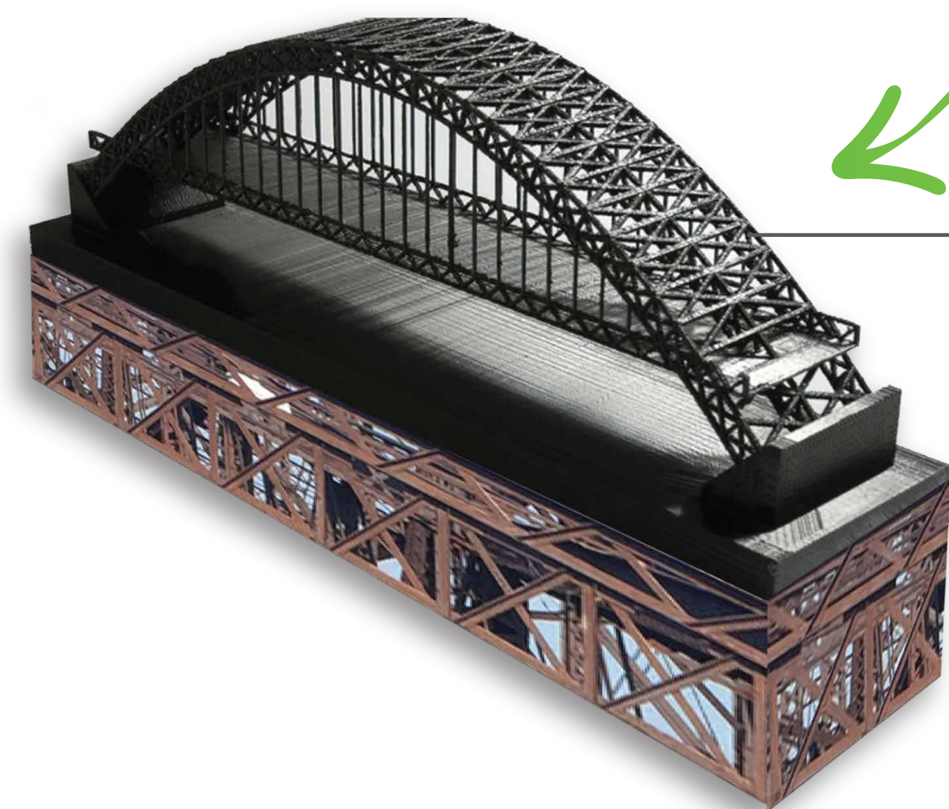
Sample display from inaugural exhibit: "HUMAN INNOVATION: BRIDGES"

3D printed sculpture, artwork generation open to the public